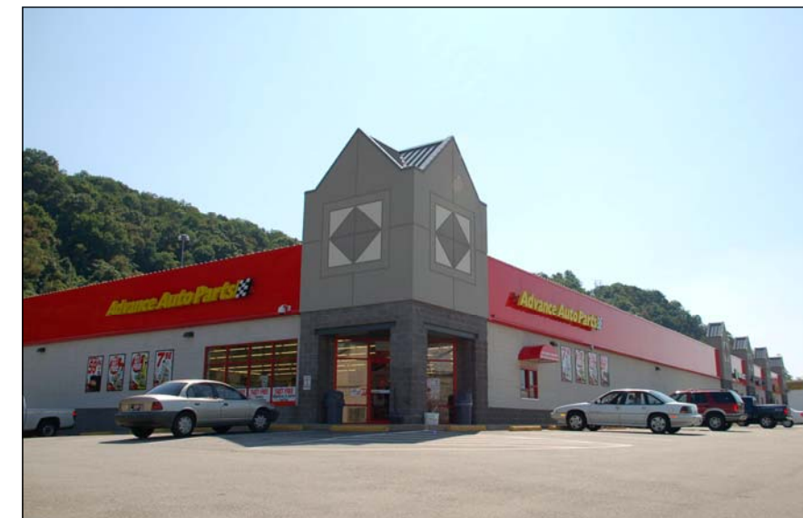
Anchored by Advance Auto Parts